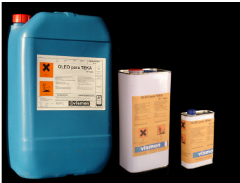
Packaging 25 litres, 5 litres, 1 litre

To construct or to decorate with white or copperized wood it requires a special attention in treatments of nutrition and resistance to the physical and biological attacks like its visual aspect.